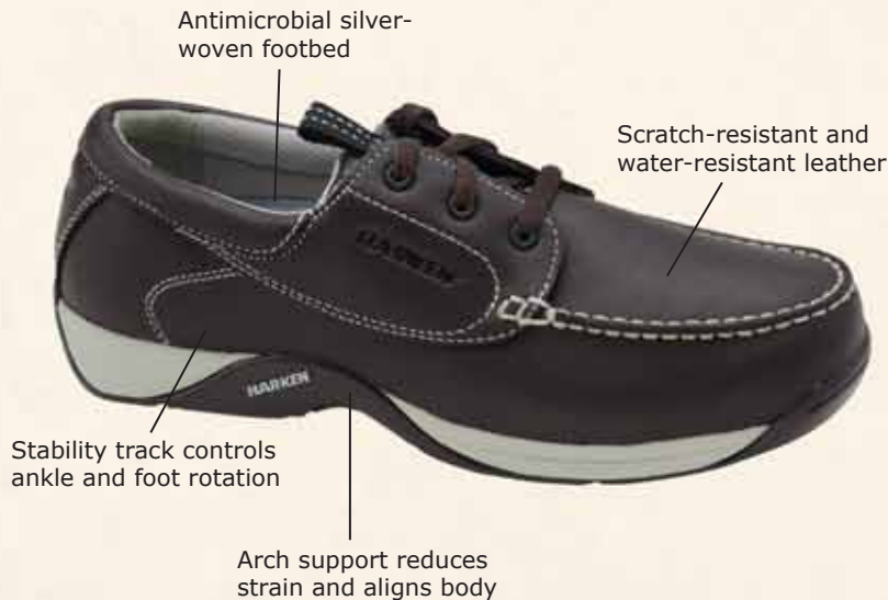
#2057 Classic Leather *Limited quantities

Harken's Classic Leather Shoe offers the full support, fit, and performance of an athletic shoe with the sophisticated look of a timeless classic. The leather is treated for maximum scratch resistance and is safe to use in wet conditions. Features Harken's 360-Degree Radial Traction Zones, silver-woven footbeds, one-way drainage system, and quick-dry materials. Imported.