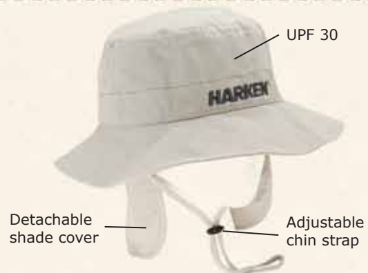
Style #1139068 Antigua Sun Hat

Stay cool and shaded all day with this UPF 30 sun hat. Imported.